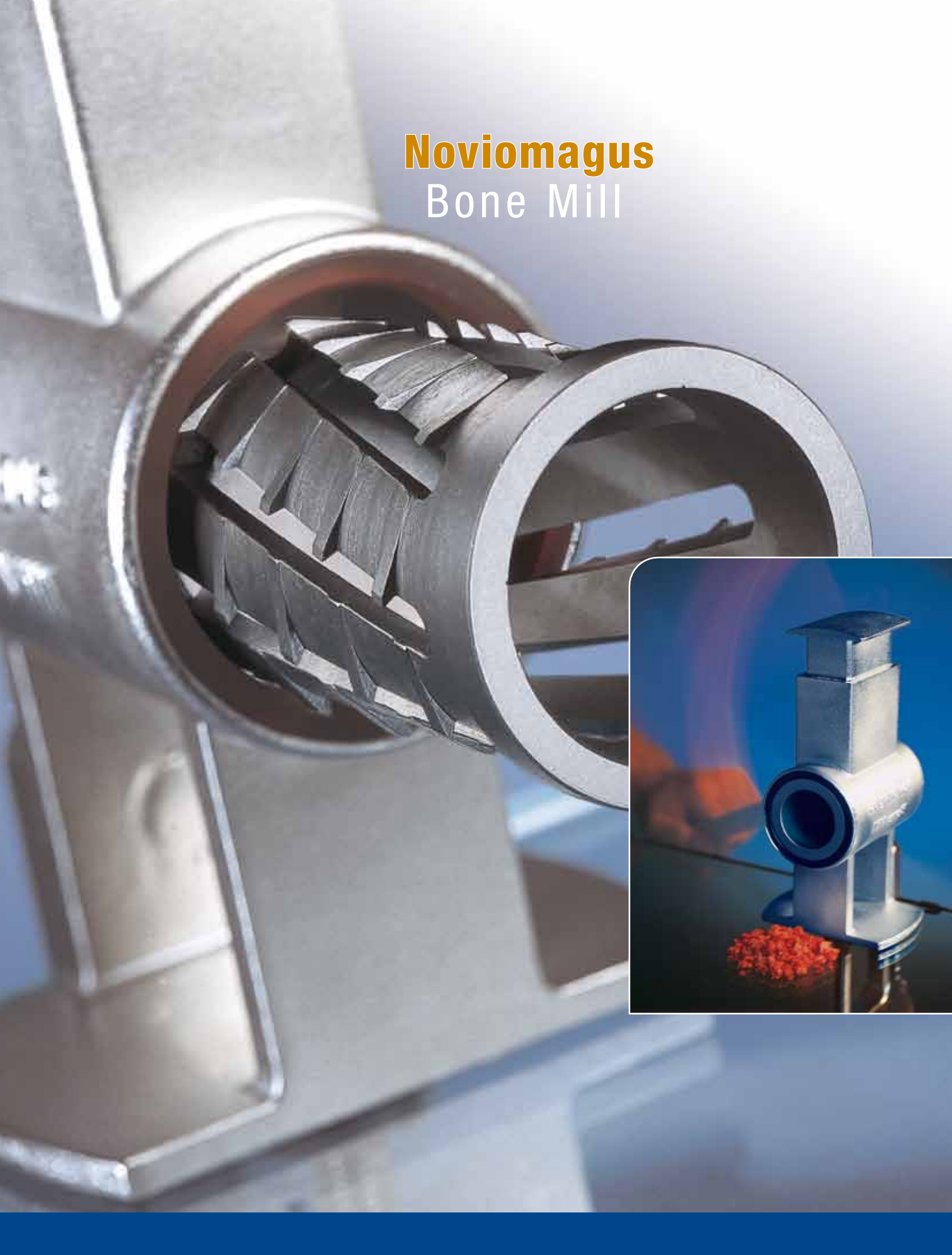
Today's technology guarantees high quality chips