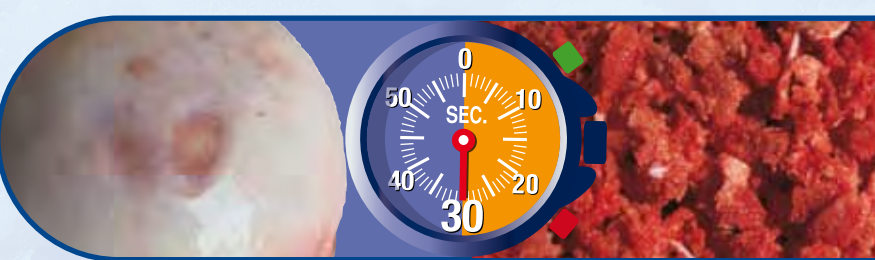
Less than 30 seconds!

The Noviomagus Bone Mill guarantees bone chips with an intact trabecular bone structure, because it breaks out chips. The coarse milling drum is designed to produce large bone chips for acetabular and proximal femoral grafting. The fine milling drum is designed to produce small bone chips for distal femoral grafting. The extra-fine milling drum is designed to produce extra-small bone chips for spinal grafting and small defects.